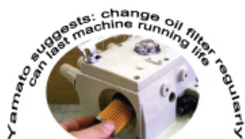
equipped with " Oil Filter "

Precise reasonable design, high quality parts ensure CZ series for quick acceleration, low noise and little vibration. Thus, the fatigue of operators is minimized. And instable operation and injuries are consumedly decreased. Moreover, low noise/little vibration proves less abrasion of the machine, which means longer running life.