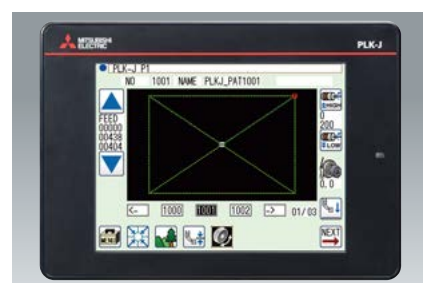
Easy to see operations and simple 6.5-inch color operation panel