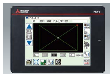
Easy to see operations and simple 6.5-inch color operation panel