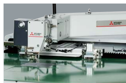
Easy maintenance! New arm-shaped, glass epoxy slide plate