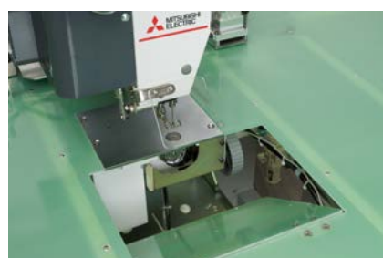
The bobbin can be replaced from the top